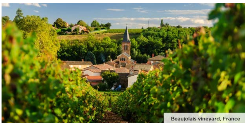
Beaujolais vineyard, France

Book by December 31, 2022 and SAVE $750 per person