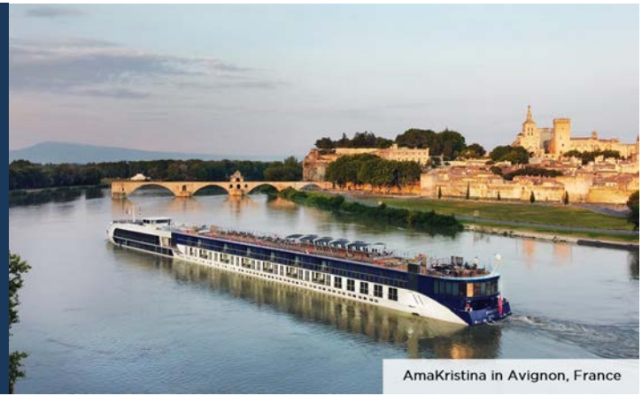
AmaKristina in Avignon, France

7-night cruise from Arles to Lyon November 16-23, 2023 | AmaKristina